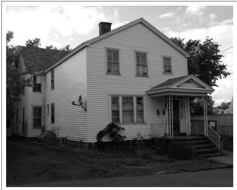
508 Wiley Street Utica, New York

Architect: C. Lewis Tomaselli Architects